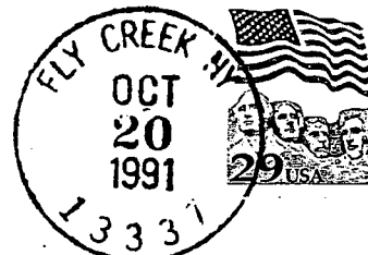
Fly Creek United Methodist